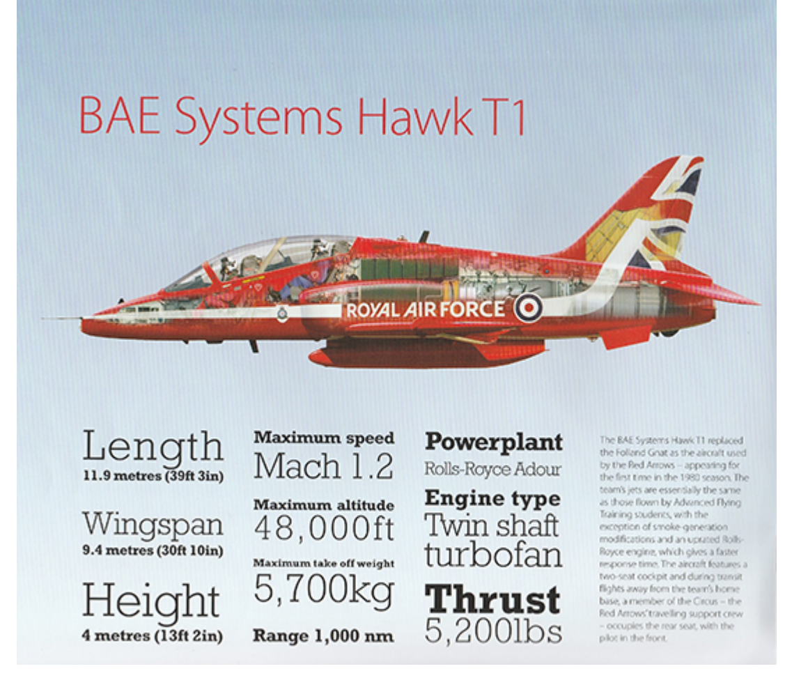
A profile and specifications of the BAE Systems Hawk TI flown by the Red Arrows