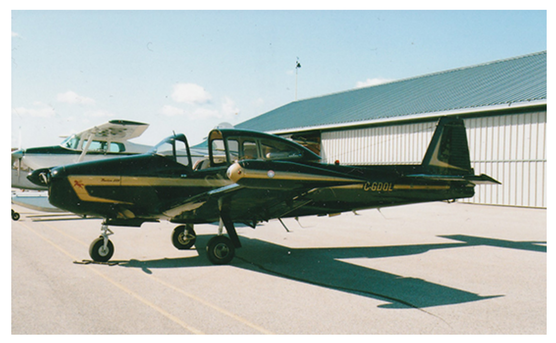
Ryan Navion C-GDQL exemplified the classic aircraft at Edenvale