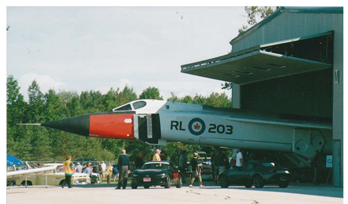
The full scale Avro Arrow replica displayed at Edenvale by the Canadian Air and Space Conservancy on Aug. 10