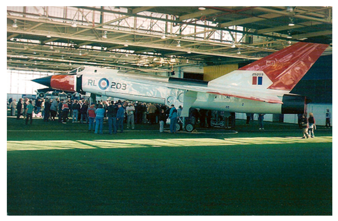
The Arrow replica as it was originally unveiled at Downsview in 2006 by the Toronto Aerospace Museum

Sunny, albeit windy, conditions made this year's Gathering of the Classics another rewarding event for everyone.