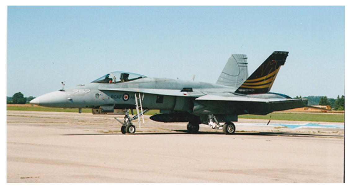
The specially painted 2019 Demo Hornet at the Brantford Community Air Show Aug. 29, 2019

A record-breaking crowd and a beautiful summer day set the stage for an impressive 2019 Brantford Community Air Show on Aug. 29.