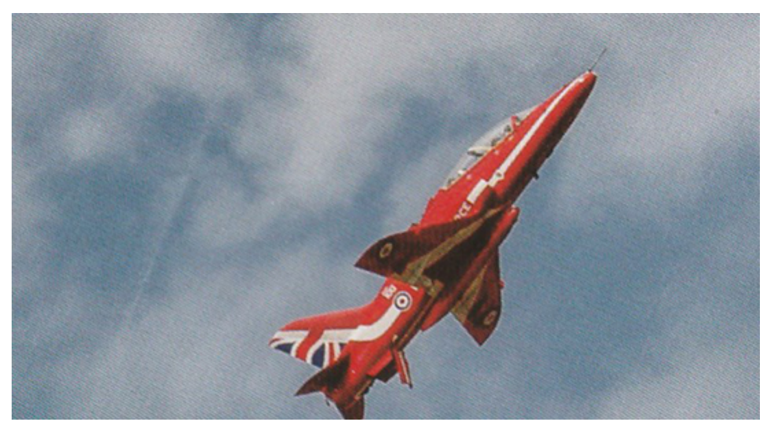
A Red Arrows Hawk scanned from the 2019 CIAS programme