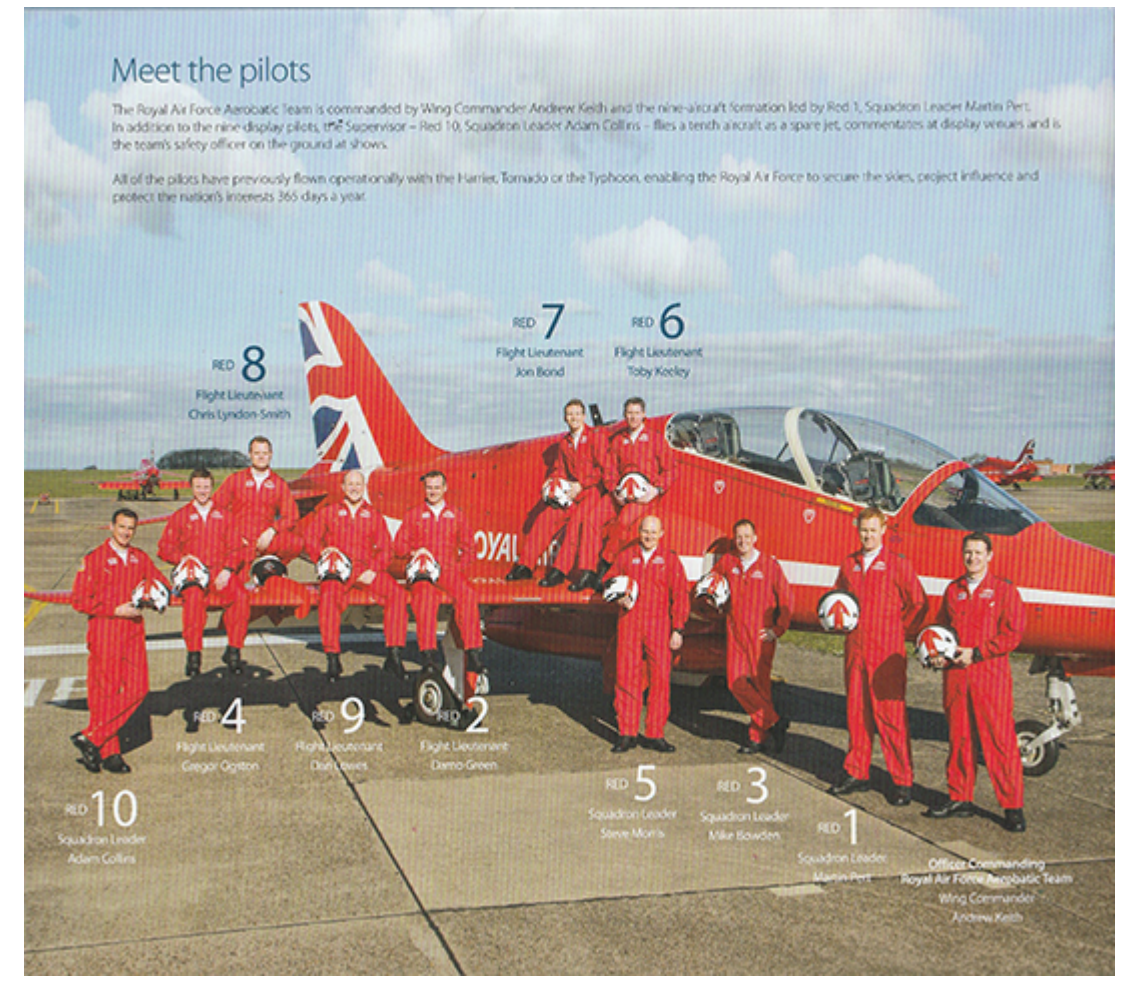
The Red Arrows pilots all of whom have previously flown operationally with the Harrier Tornado or the Typhoon