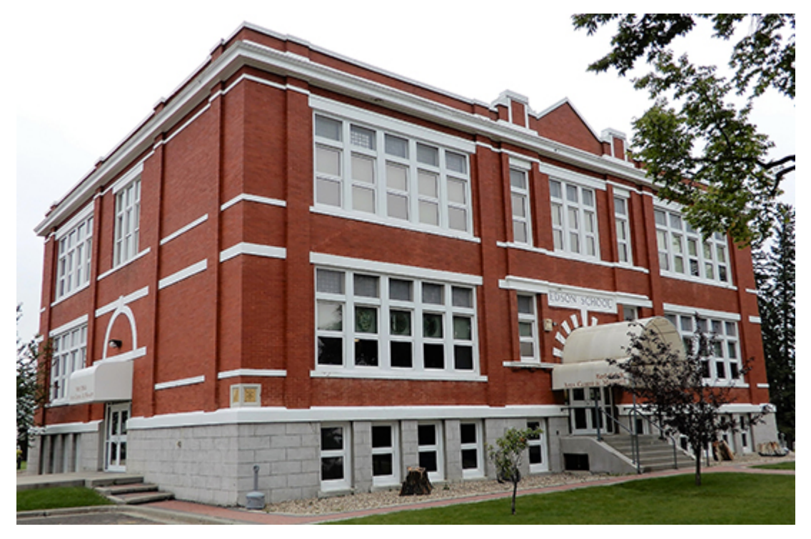
The beautifully restored 1913 Edson School, now known as the Red Brick Arts Centre and Museum includes a 1920s