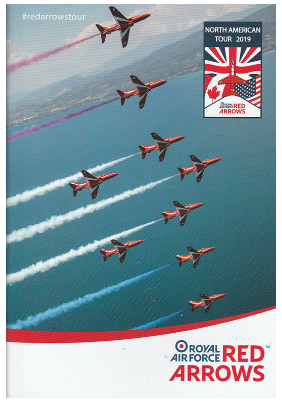
The Red Arrows North American Tour began in Halifax August 11 and is set to conclude Oct 4 6 in Los Angeles