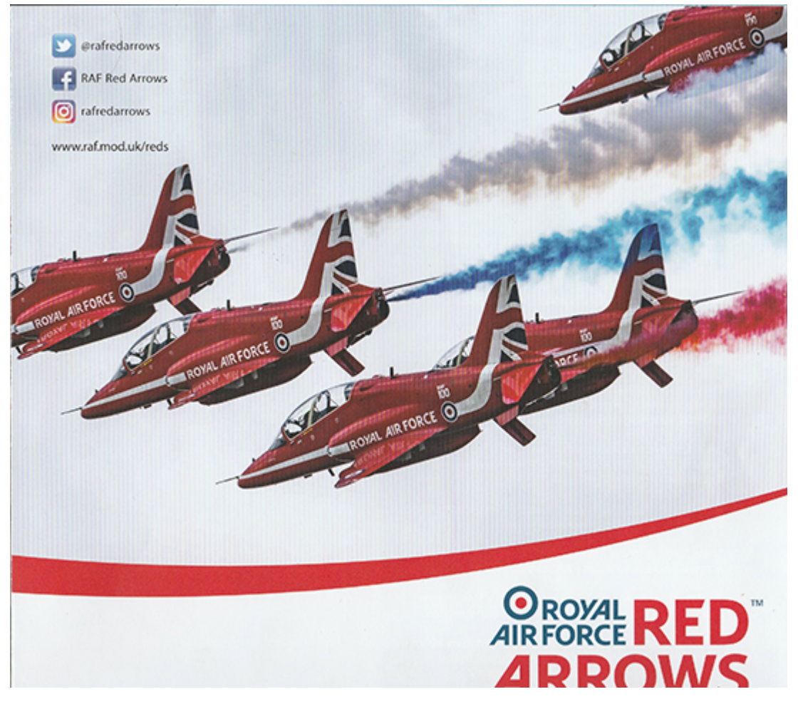
The title page of the RAF Red Arrows brochure