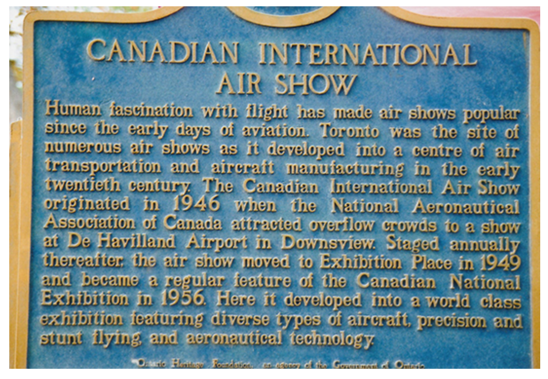
The proud history of the CIAS is outlined in this plaque on display at Exhibition Place