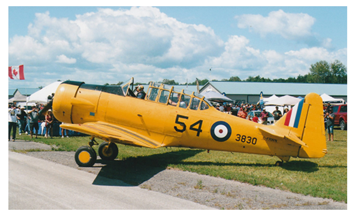
Harvard Mk 2 C-FRWN from the CHAA takes a passenger for a flight