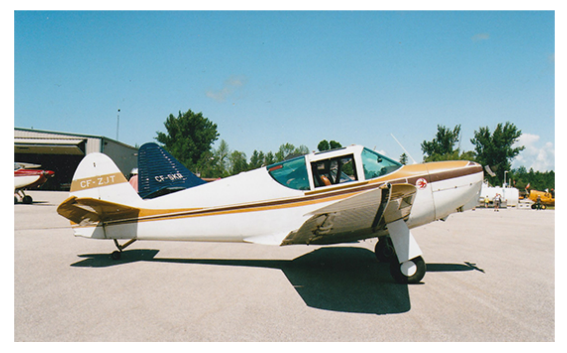
Globe Swift CF-ZJT at the Gathering of the Classics