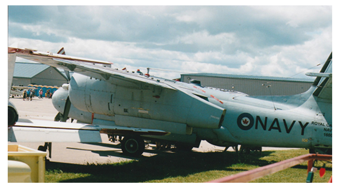
The CS2F Tracker that was part of the Canadian Air and Space Museum was displayed at Edenvale