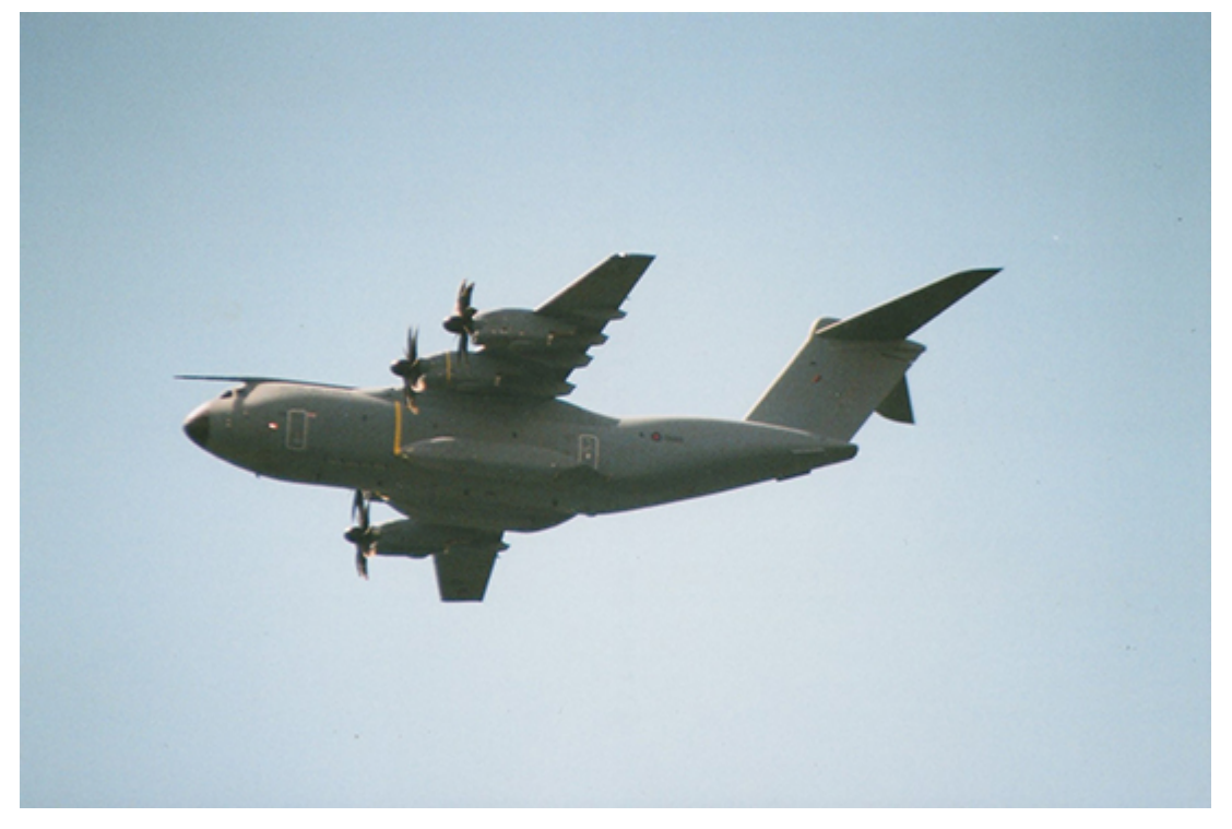
A flypast by the RAF Airbus A400M Atlas

the team, now in its 55<sup>th</sup> season. The Arrows pilots and members of the Circus --- the team's travelling support crew --- enjoyed meeting and greeting everyone during the day along with other air show participants.