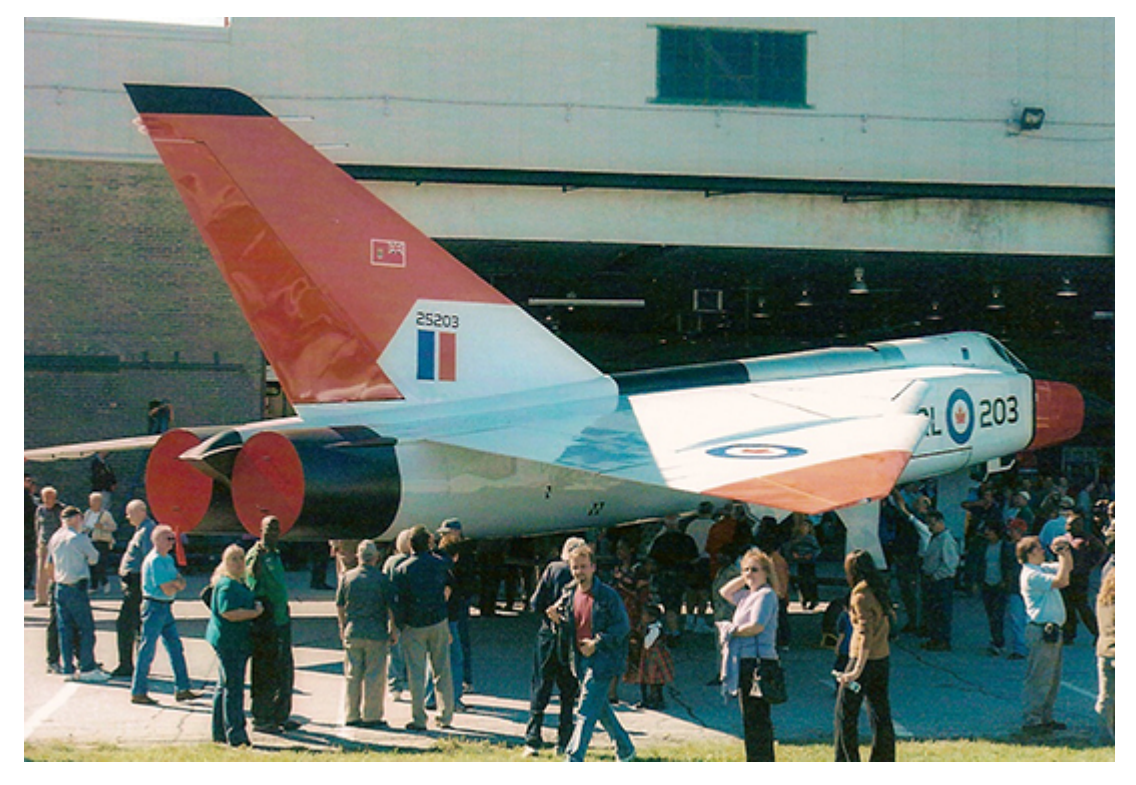
The Arrow replica attracted a crowd of fans at its original nveiling at Downsview in 2006