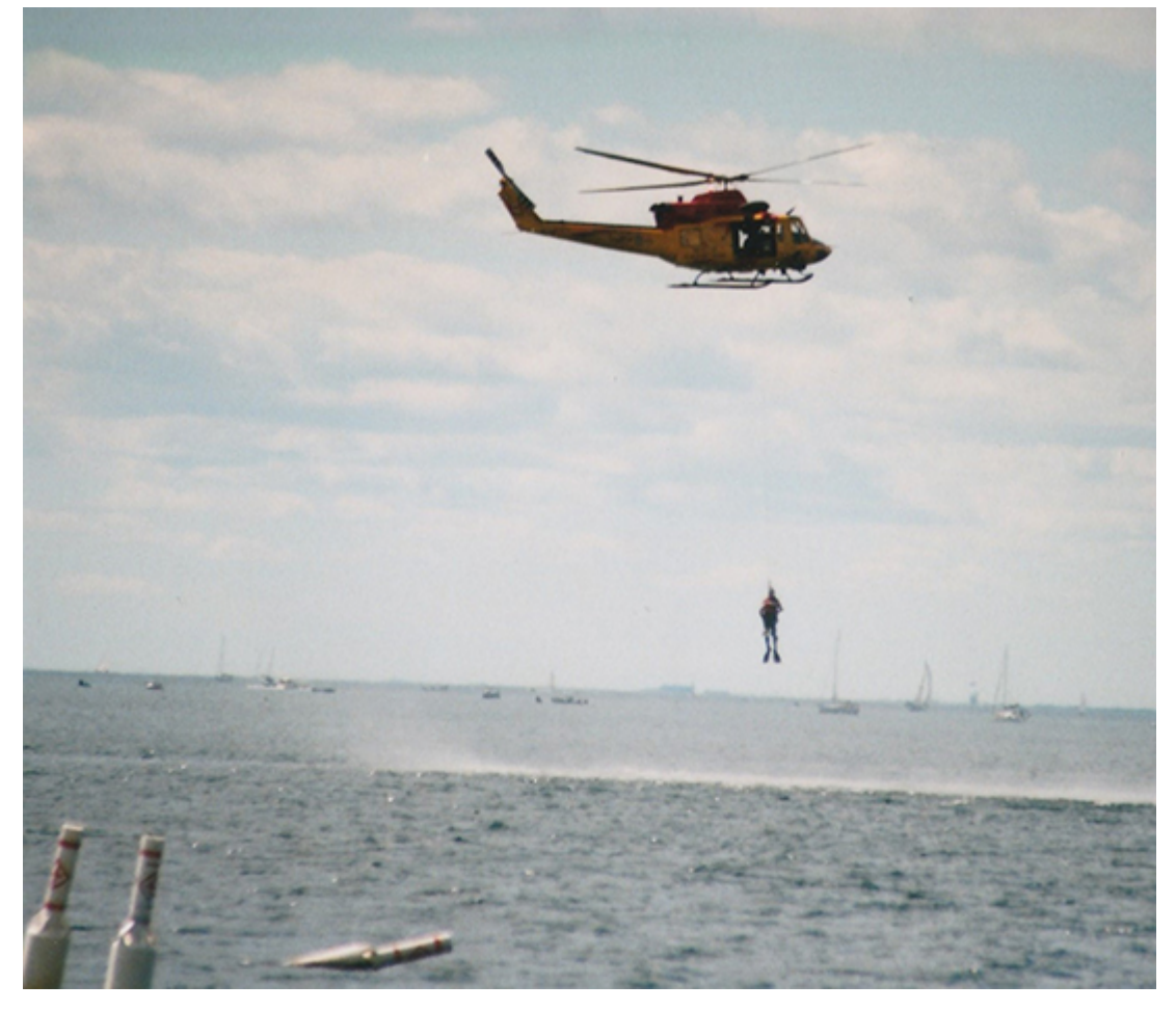
A CH-146 Griffon hoists a SAR tech from Lake Ontario in a dramatic display