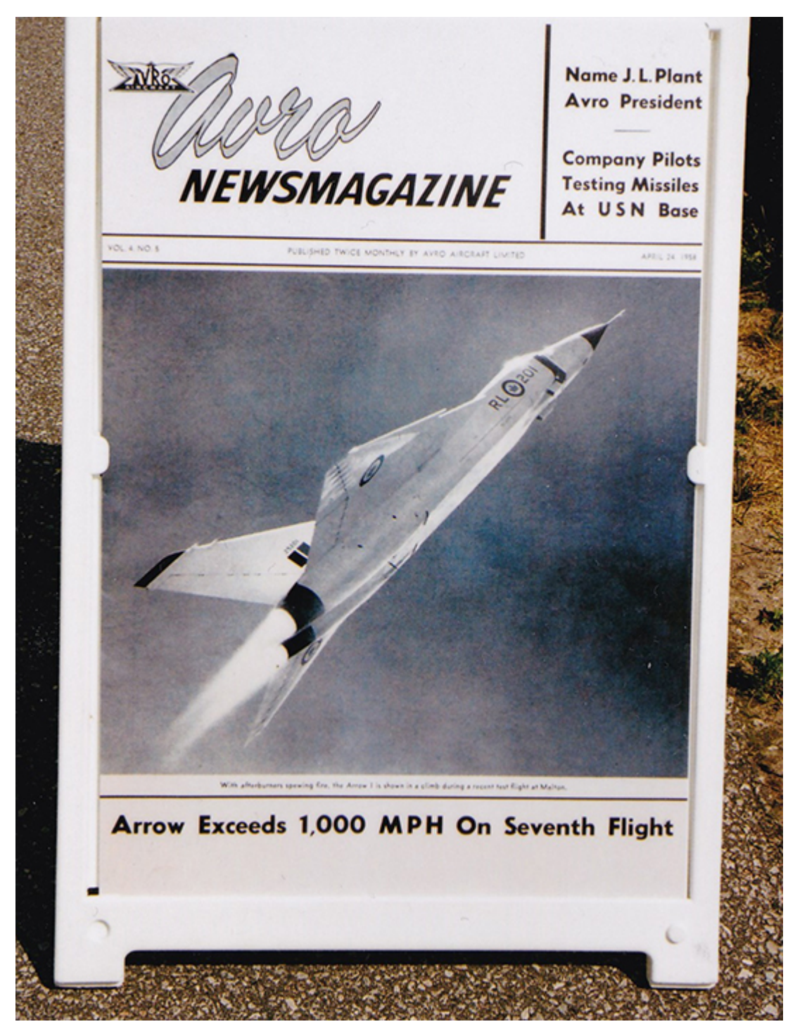
Avro Canada newsmagazine poster display at Edenvale by Marc Andre Valiquette