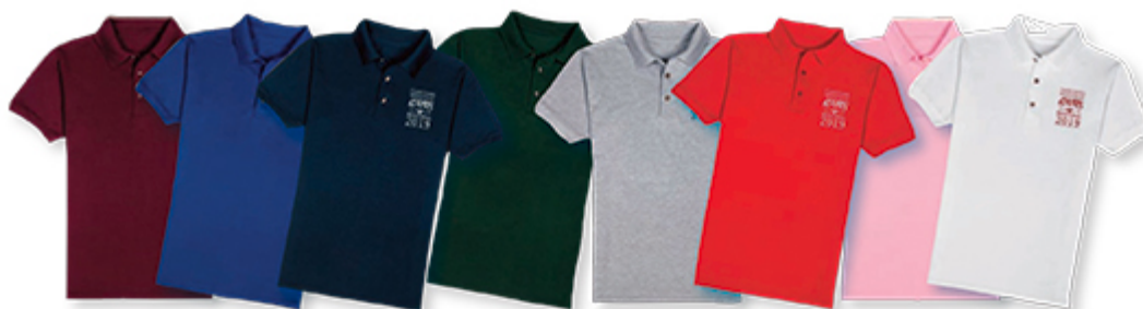
Polo Shirts – available in an assortment of colours and designs (see order form list for details)