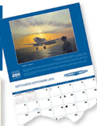
2020 Calendar each month features an individual painting