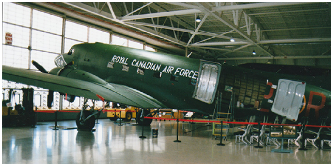
Dakota FZ692 C-GRSB at CWHM as it appeared in April.

The Douglas C-47 Dakota Mk. III of the Canadian Warplane Heritage Museum is now looking just as it did when it flew with 437 RCAF Squadron during the Second World War. Dakota FZ692/C-GRSB, a true D-Day veteran, underwent extensive maintenance at the museum during the past year, including overhaul of the engines.