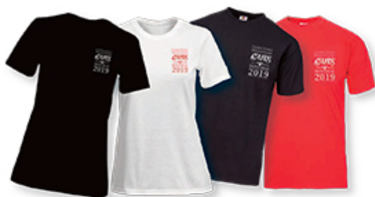
T-Shirts – Men's & Women's cuts

Custom colour combinations are available. See below.