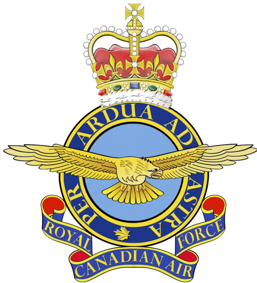
The RCAF Heritage Fund