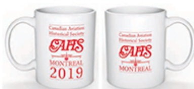
Ceramic Coffee Mug both sides printed - as shown