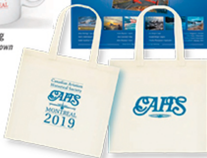
Tote Bags - logos in Blue or Red

Do you want something special to wear at the convention this year? Do you want to advertise the CAHS while you attend other aviation events or just go about your daily errands? Then how about buying a CAHS polo or t-shirt with either the CAHS convention logo or the CAHS conventional logo? The CAHS is offering a variety of merchandise for purchase. The CAHS is offering for sale polo shirts, t-shirts, baseball caps, mugs, mouse pads, and canvas tote bags, all featuring the distinctive CAHS 2019 convention logo. Merchandise details are presented below and on page 2 of the order form. Orders picked up at the CAHS Convention in