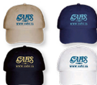
Baseball Cap - Tan, Blue, Black, & White available

Custom colour combinations are available. See below.