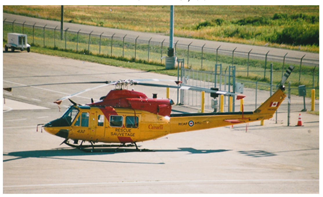
CH-146 Griffon RCAF 424 Squadron #146432 at CWH Air Force Day, July 7, 2018.