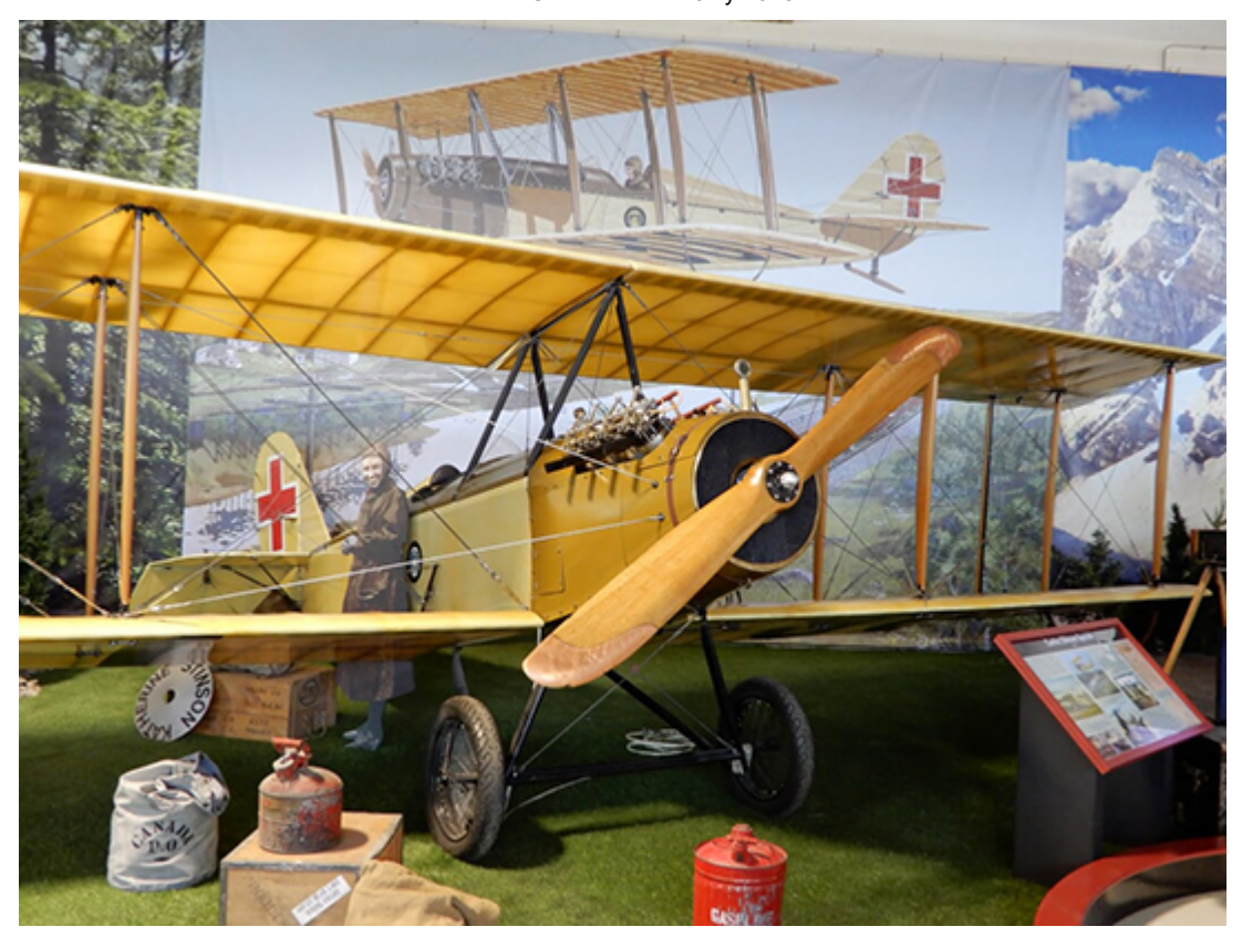
The Curtiss Special display at the Alberta Aviation Museum. Backdrop for the display is a huge enlargement of the painting by Jim Bruce.