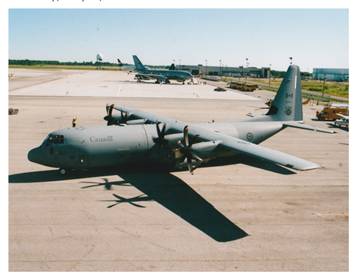
Lockheed CC-130J Hercules RCAF 130610 arrives at CWH Air Force Day, July 7, 2018.