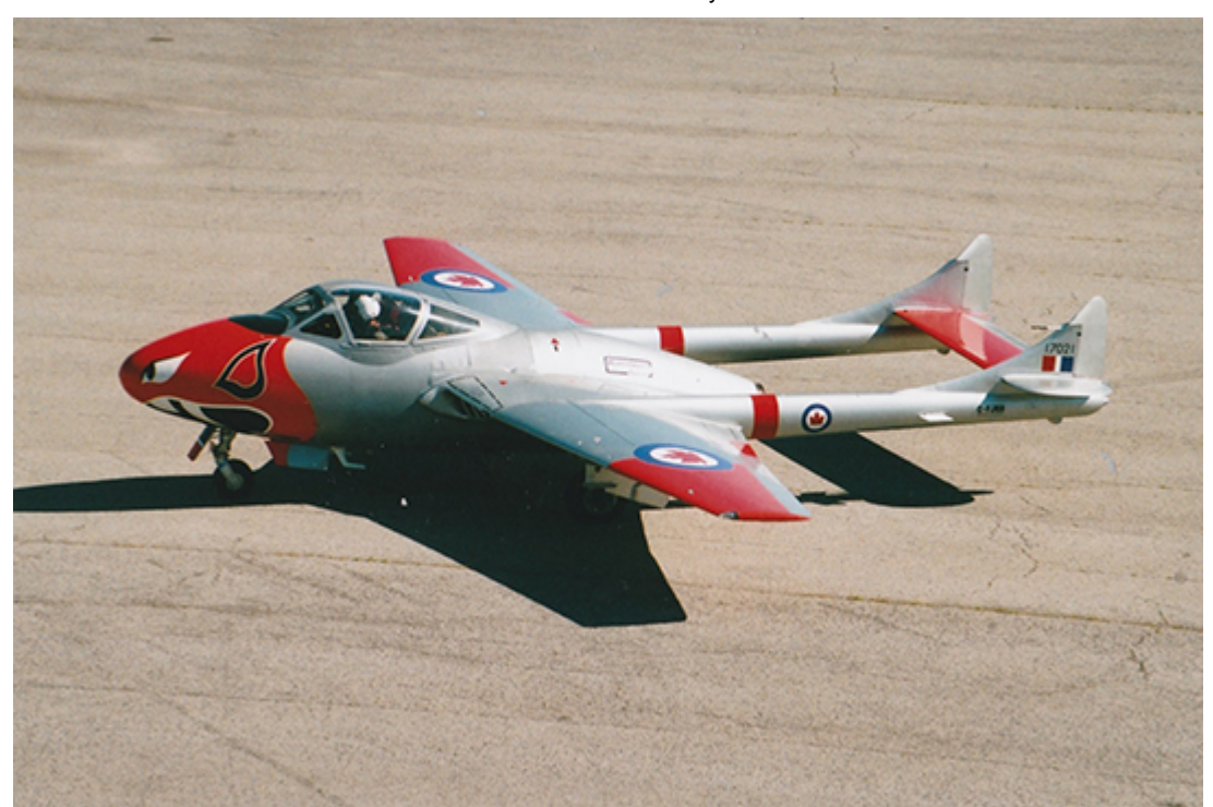
Waterloo Warbirds D.H. 115 Vampire Mk 55 C-FJRH in RCAF colours at CWHM Air Force Day, July 7, 2018.