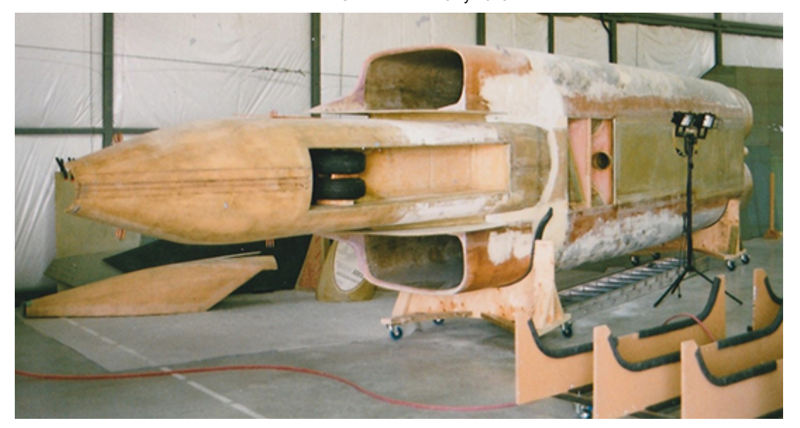
A view from the front of the underside of the Arrow II fuselage.