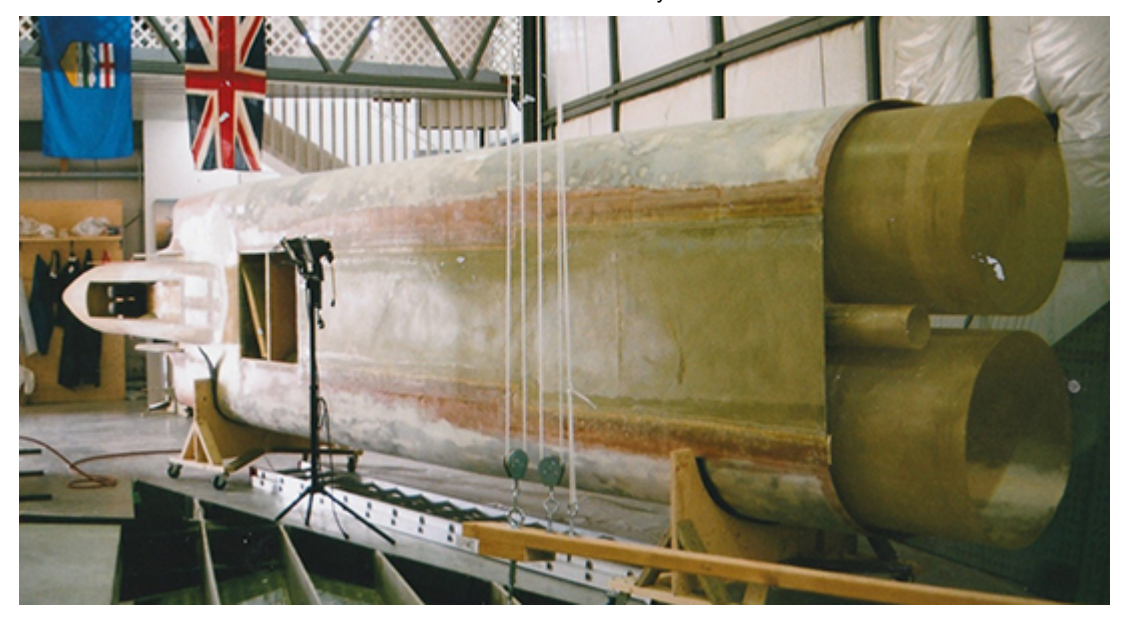
A view from the rear of the underside of the Arrow II fuselage.