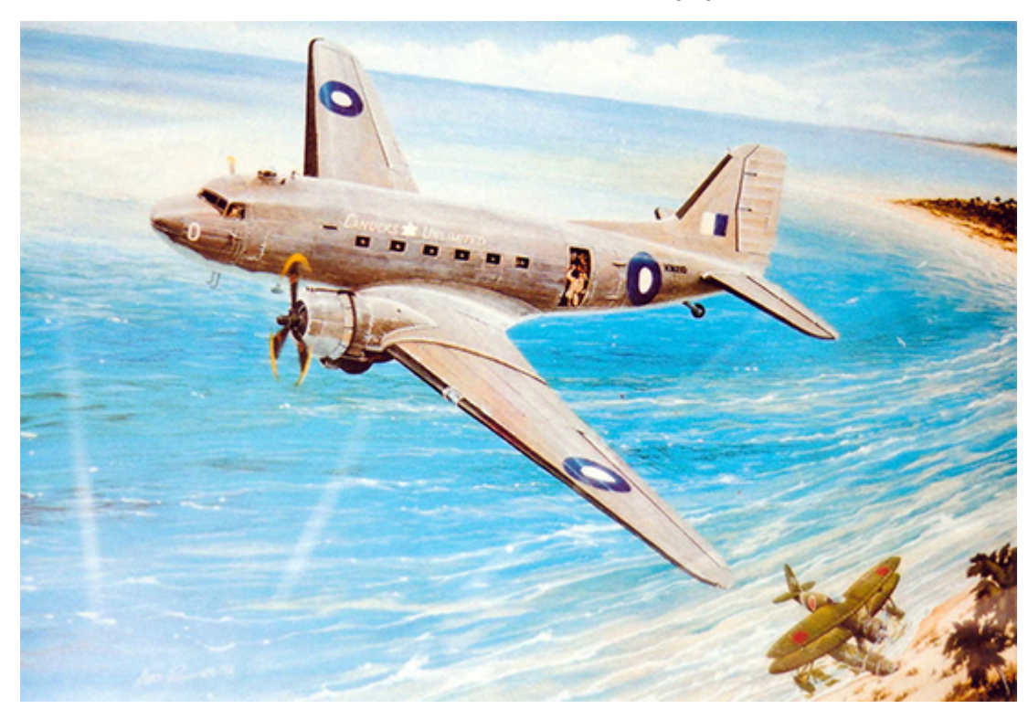
Bricks Away by Lance Russwurm