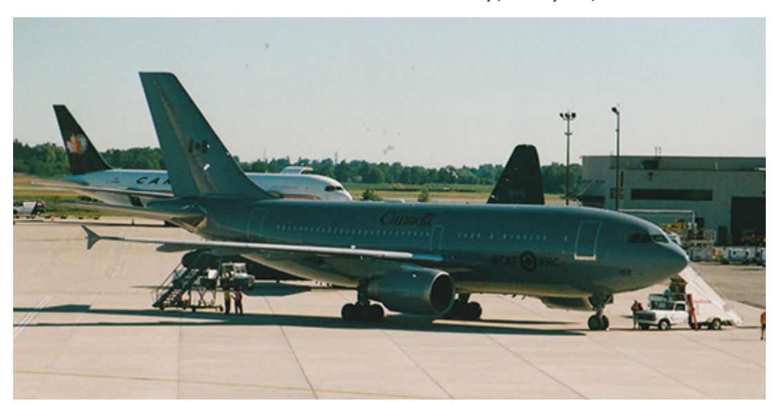
Airbus CC-150 Polaris RCAF 15002 at CWH Air Force Day, July 7, 2018.