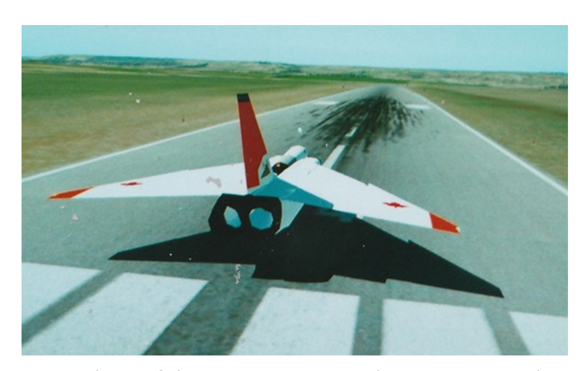
A simulator of the Arrow II is a popular attraction at the Avro Museum.