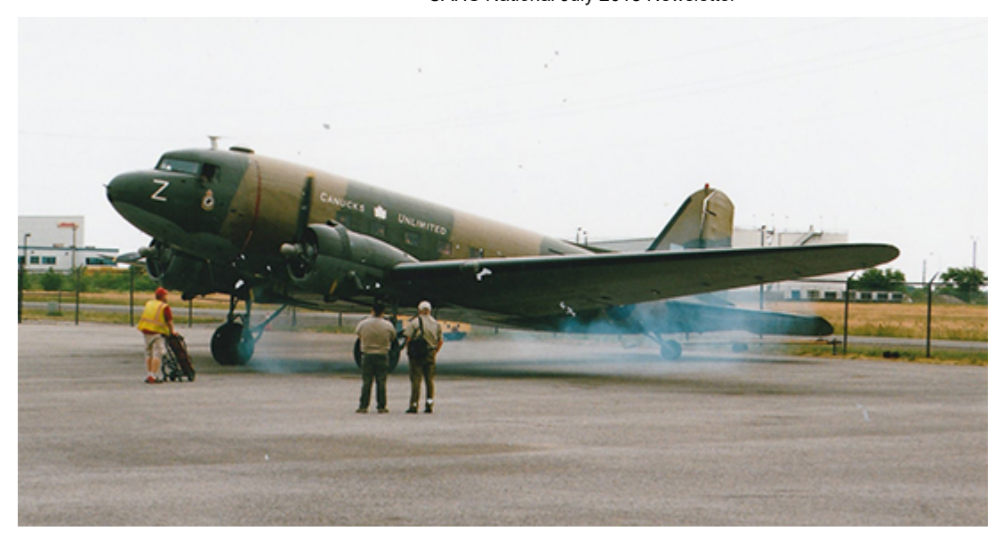
CWHM DC-3 in Canucks Unlimited colours of Dakotas flown by RCAF No. 435 and 436 Sqdns. fires up at CWH Flyfest June 16, 2018.