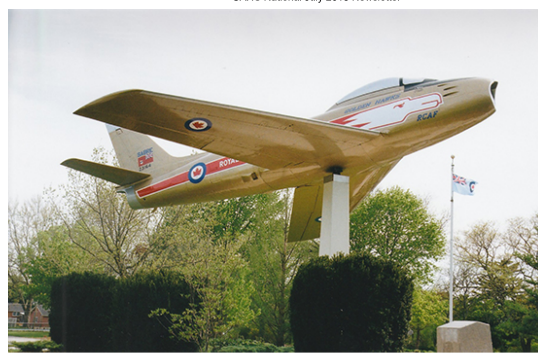
403 Wing Sarnia RCAFA members advocated and supported the restoration of Golden Hawks Sabre V #23164 at Germain Park.