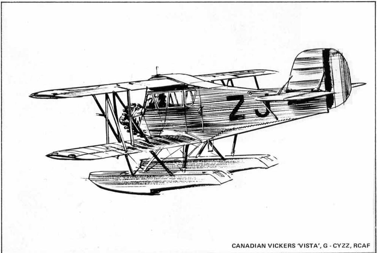
CANADIAN VICKERS 'VISTA', G - CYZZ, RCAF