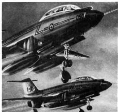
94 The Mighty Voodoo