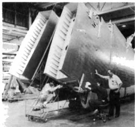
80 The Canadian Connection