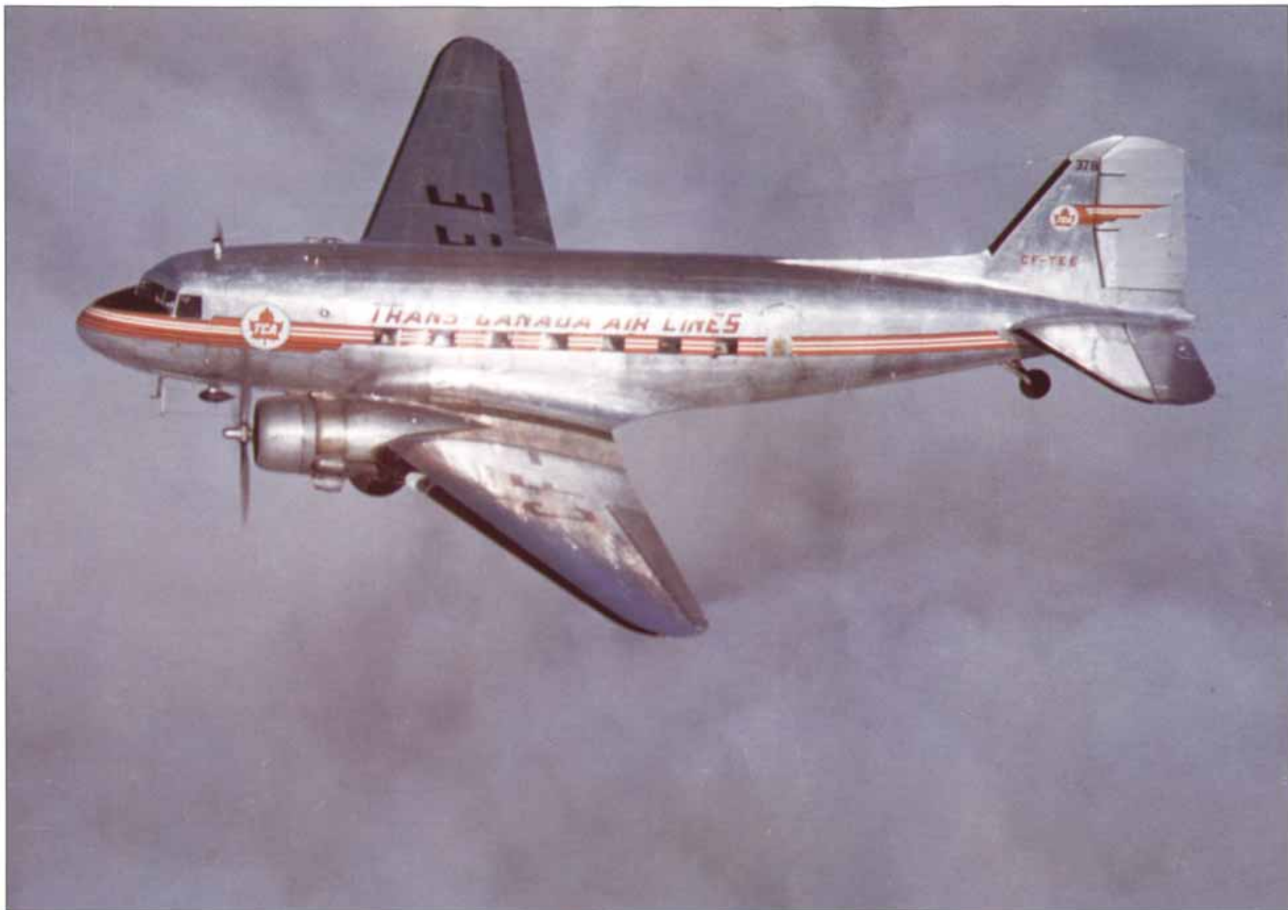
May, 1955: Trans-Canada Air Lines DC-3, CF-TEE as seen from an overtaking North Star.