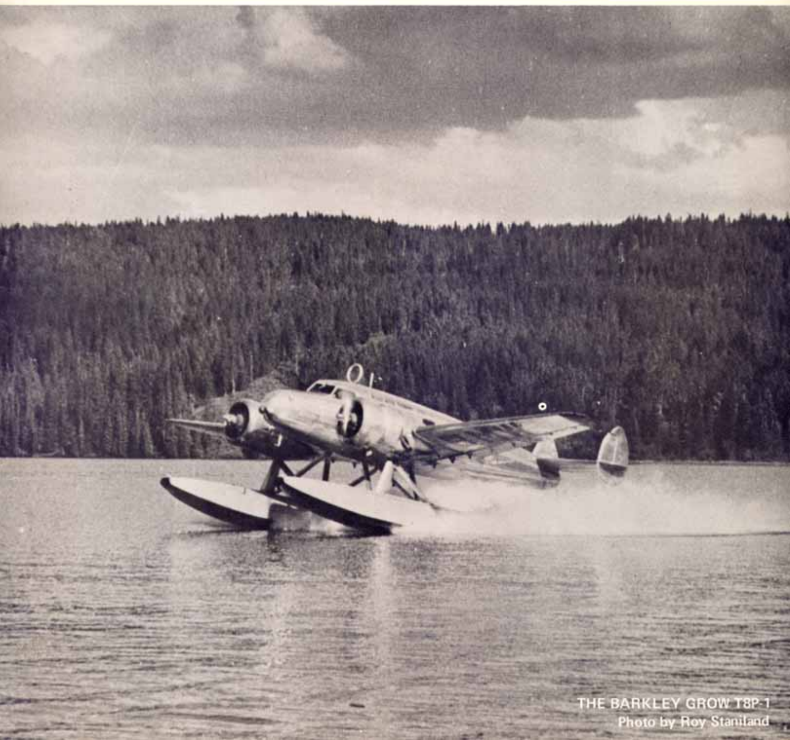
THE BARKLEY GROW T8P-1