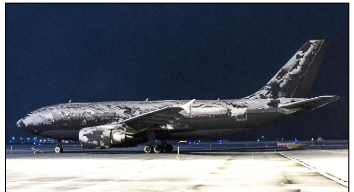
RCAF CC-150 Polaris, 15003, took on an unusual appearance on 27 October 2016 as Ottawa’s first slushy snowfall of the season began to melt and slide off the aircraft. The Polaris was positioned at MCIA for several days while Prime Minister Trudeau’s trip to Brussels to sign the CETA trade accord remained up in the air. The PM and his delegation eventually left on October 29 after a short mechanical snag with a flap caused the aircraft to return to Ottawa for resolution.