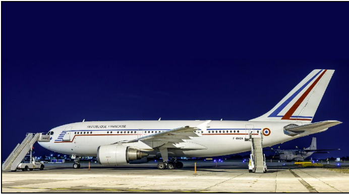
French Armée de l’Air Airbus A310-304 (c/n 421), F-RADA, was one of a three-aircraft contingent accompanying French Prime Minister Manuel Valls on his official visit to Ottawa, 13 October 2016.