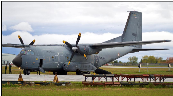
This ageing French Armée de l’Air Transall C-160NG (c/n 215), 64-LG, was one of the three French air force aircraft seen in Ottawa during Prime Minister Manuel Vall’s visit on 13 October 2016.