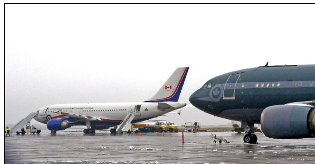
A busy day on the Canada Reception Centre ramp, 28 October 2016. On the left, RCAF CC-150 Polaris 15001 is being readied for Governor General David Johnston’s departure on a two-week trip to the Middle East, while 15003 remained on standby to take Prime Minister Justin Trudeau to Brussels to sign the CETA trade agreement (eventually departing October 29).