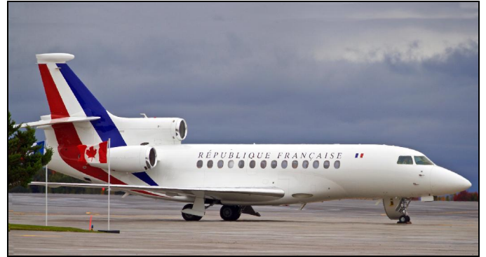
This Dassault Falcon 7X (c/n 68), F-RAFA, seen on 13 October 2016, from the French Armée de l’Air presidential flight is a civil registered military aircraft but carries no identification marks other than the République Française titles.