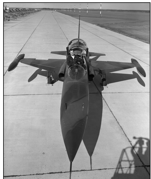
LCol Lafrance, as CO 433 Squadron, in CF-5 cockpit