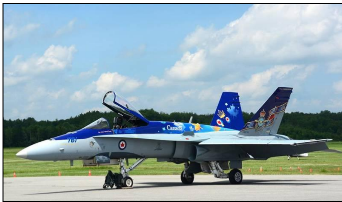
RCAF CF-188 Hornet 188761 in its special 2014 colour scheme that celebrates the 90 th anniversary of the RCAF