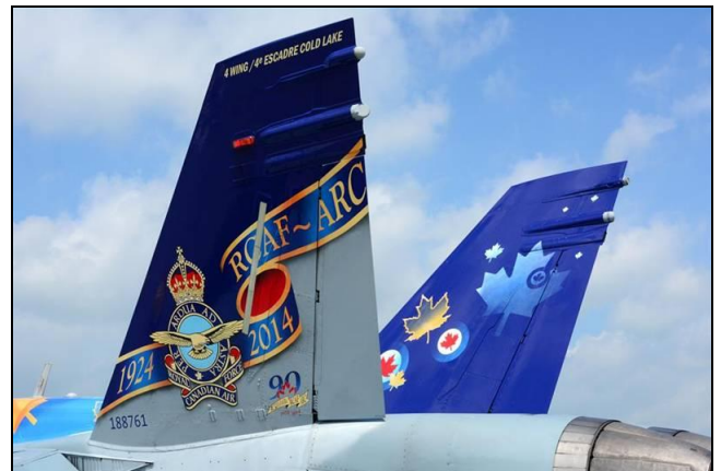
Tail markings detail, RCAF 2014 Demo-CF-18 at VWoC Hadfield Summit