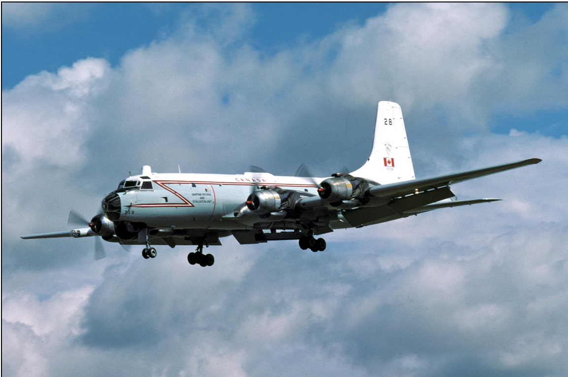
RCAF CP-107 Argus No. 10728, Ottawa (YOW) 1975

Everything you ever wanted to know about the Argus fleet, from the people who crewed them.