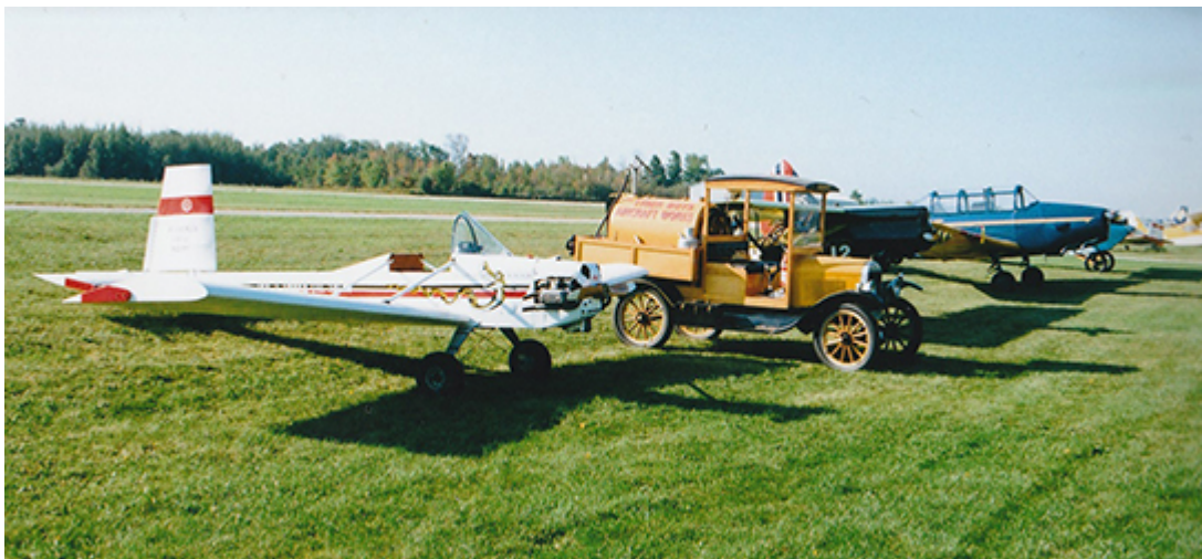
A newly completed VP-1 Volksplane and the Tiger Boys vintage Ford truck are in the foreground at the lineup on Sept. 15, 2018.