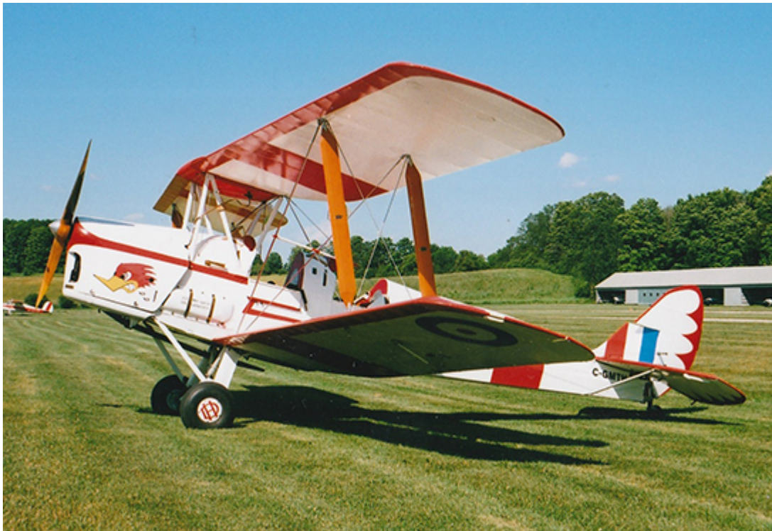
DH82A Tiger Moth 'Woody,' C-GMTH, of the Tiger Boys in its eye-catching paint scheme. June 28, 2018.