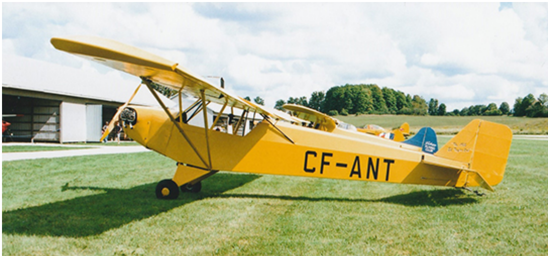
Taylor E-2 Cub CF-ANT, was the first Cub to fly in Canada.