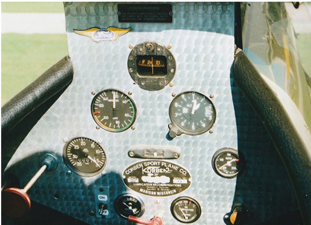
The cockpit of the Corben Super Ace with original Corben Sport Plane Co. nameplate and lubrication recommendations.