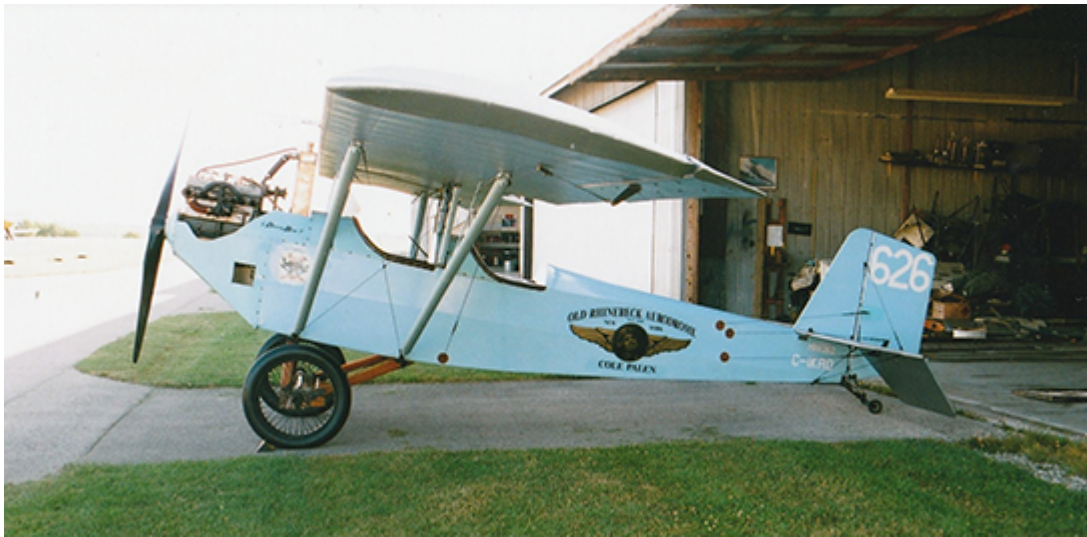
1929 Pietenpol C-IKRO of the Tiger Boys was the fourth built by Bernard Pietenpol. 40 hp Model A engine June 28, 2018.