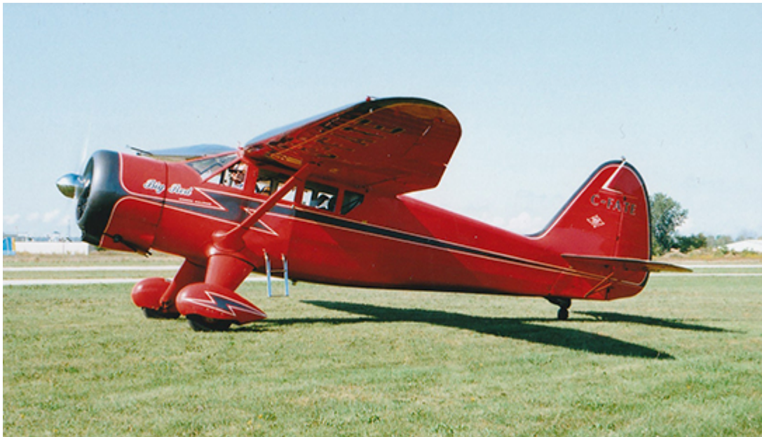
Stinson Reliant C-FATE, Big Red, at Guelph, Sept. 15, 2018. Based at Burlington in the summer and Calgary in the winter.