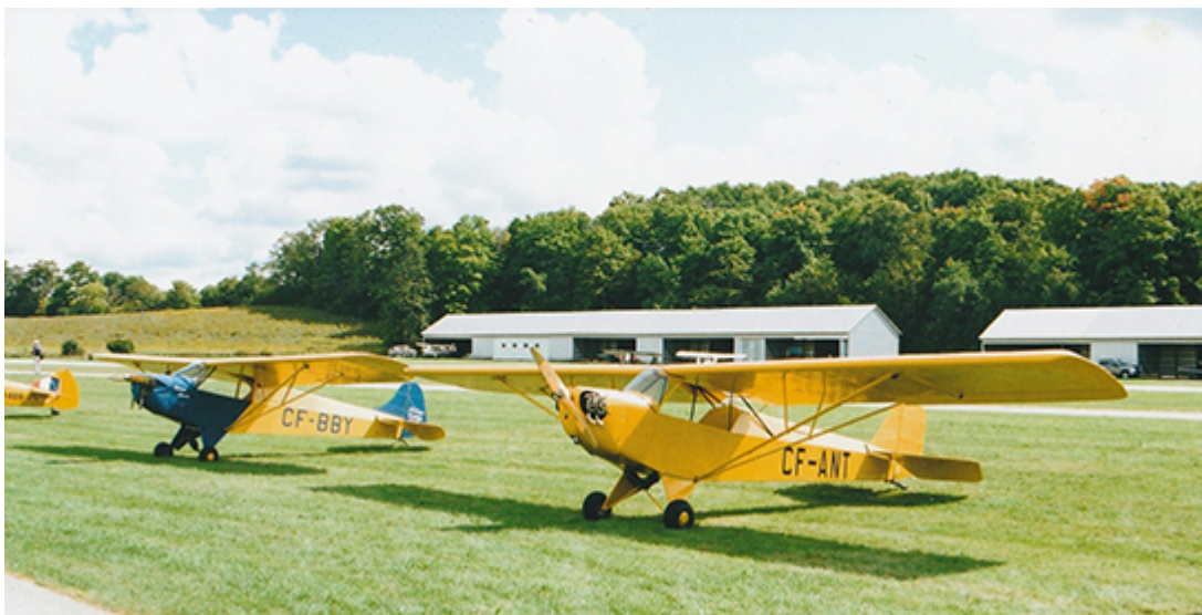
Vintage Cubs at Guelph, Piper J-2 CF-BBY and Taylor E-2 CF-ANT, Sept. 15, 2018.