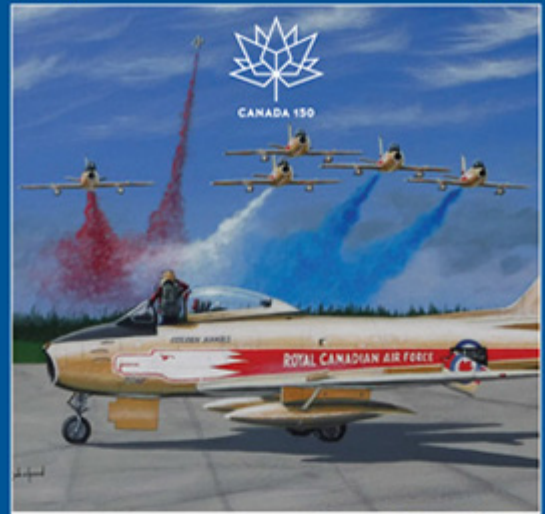
Author: in Golden Age , detail of a painting by Peter J. Rubin (1964)

The JOURNAL of the CANADIAN AVIATION HISTORICAL SOCIETY Vol. 55 No. 4 Winter 2017