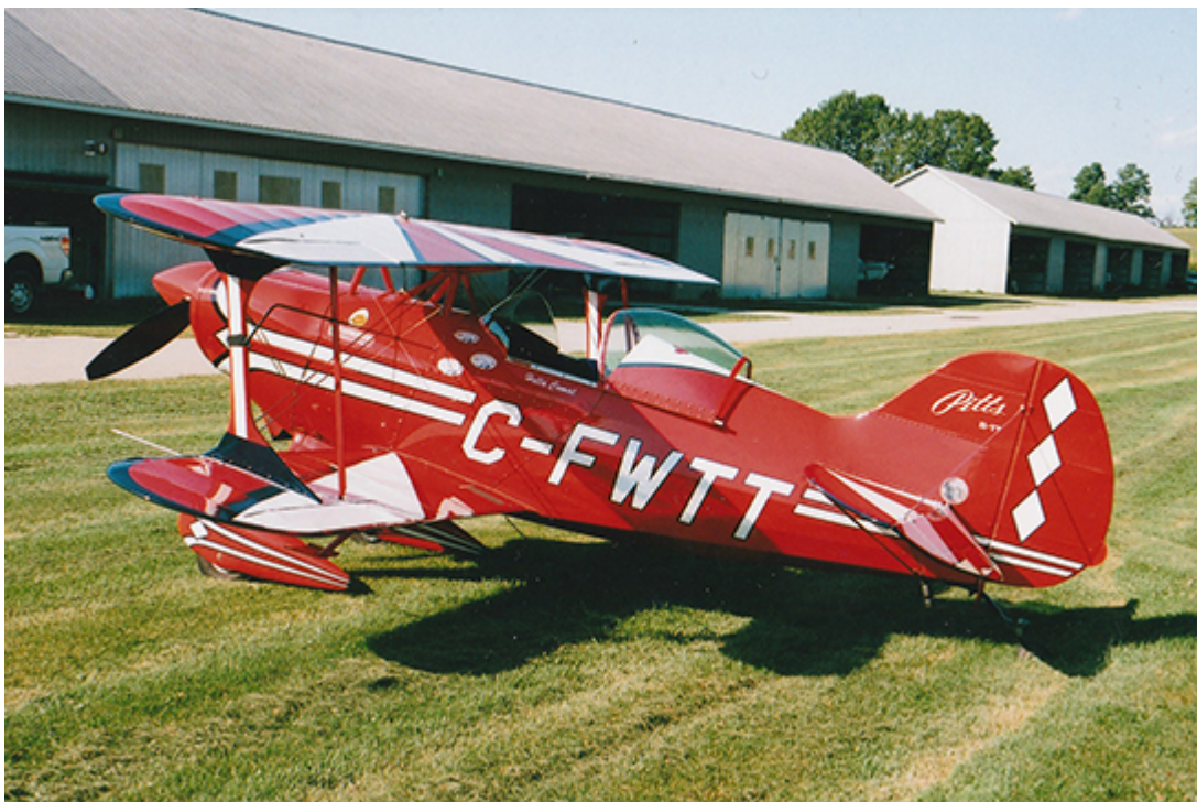
Pitts Special S1-T, C-FWTT, was flown in by accomplished aerobatic pilot Hella Comat. June 28, 2018.