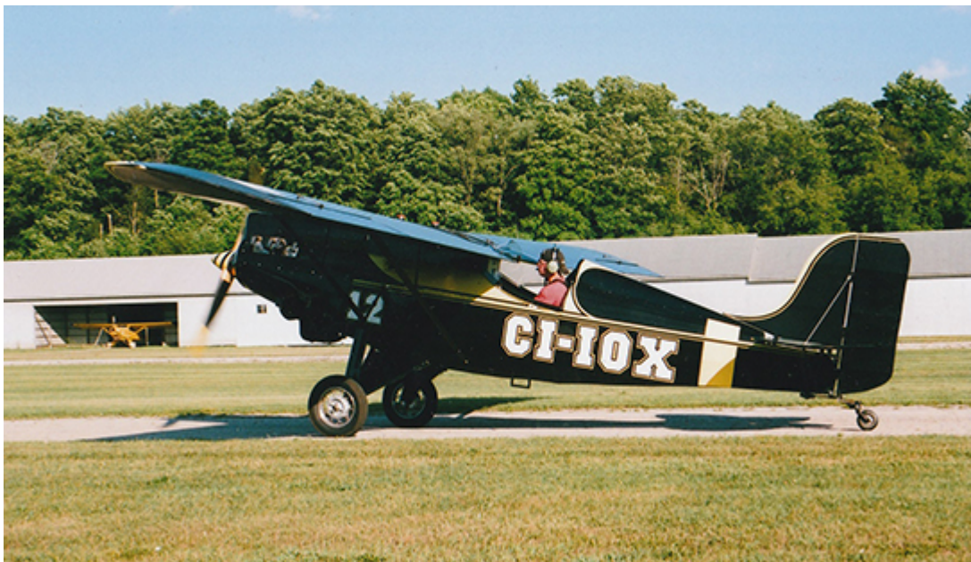
Corben Super Ace, CF-IOX, of Guelph Tiger Boys, 12th one built by Corben in Chicago. Ford Model A engine. June 28, 2018.