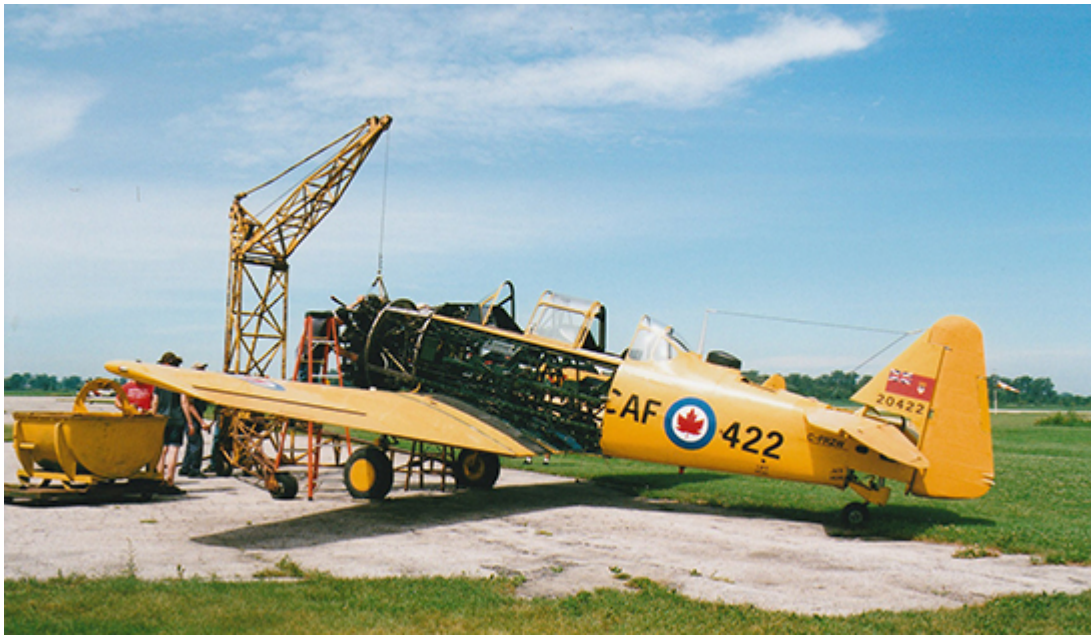
CHAA volunteers remove the engine from a Harvard Mk 4 during the 80 th Anniversary celebration.