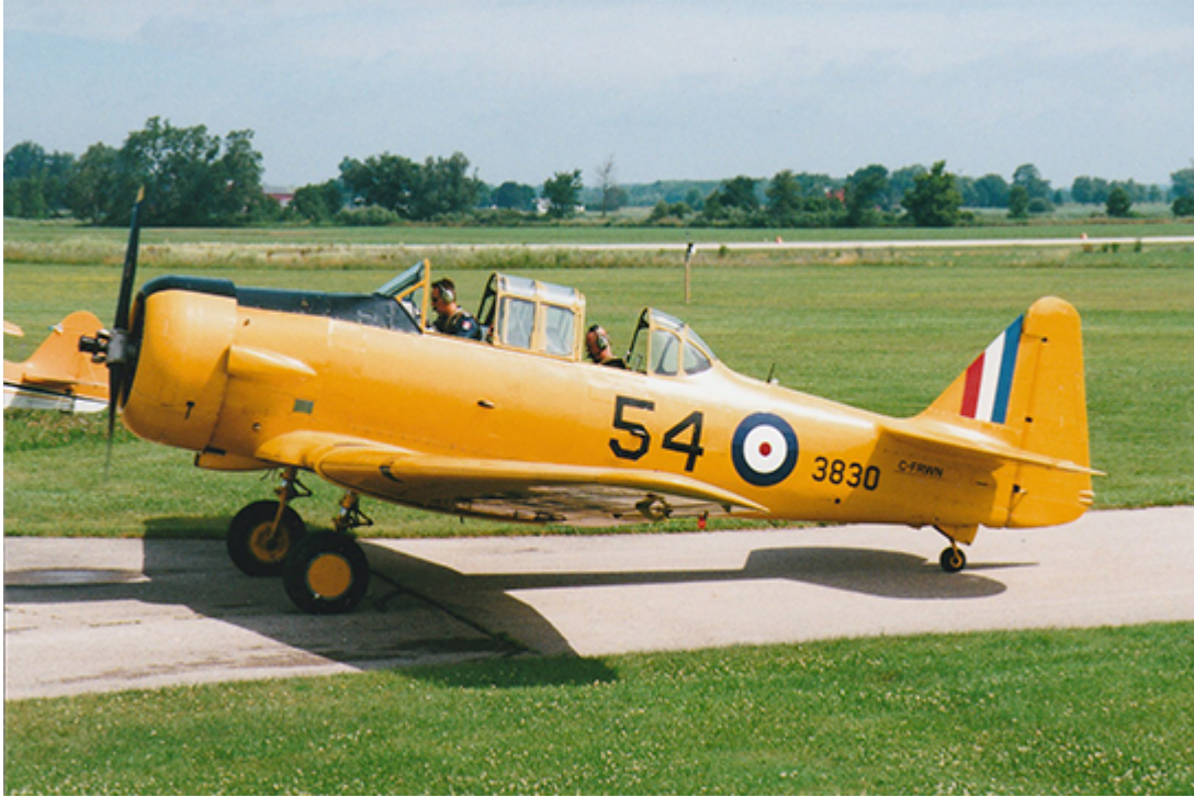
Harvard Mk 2 C-FRWN taxis out during the 80th Anniversary of the Harvard.