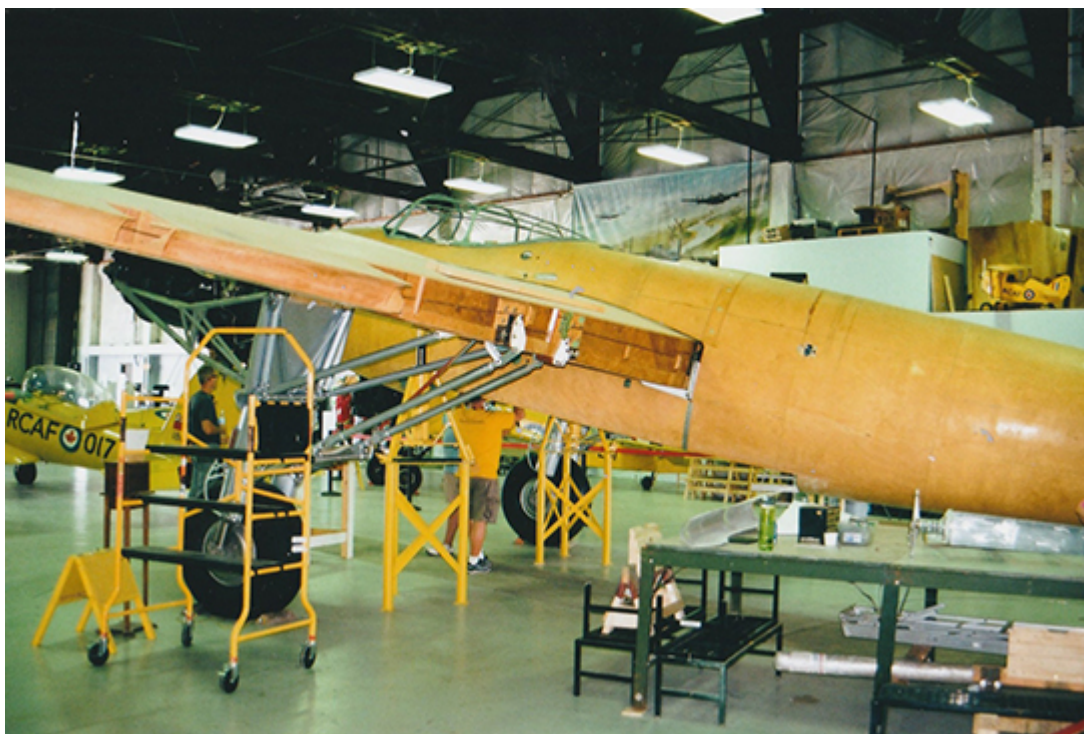
Side view of CH2A Mosquito at Windsor, July 20, 2018.