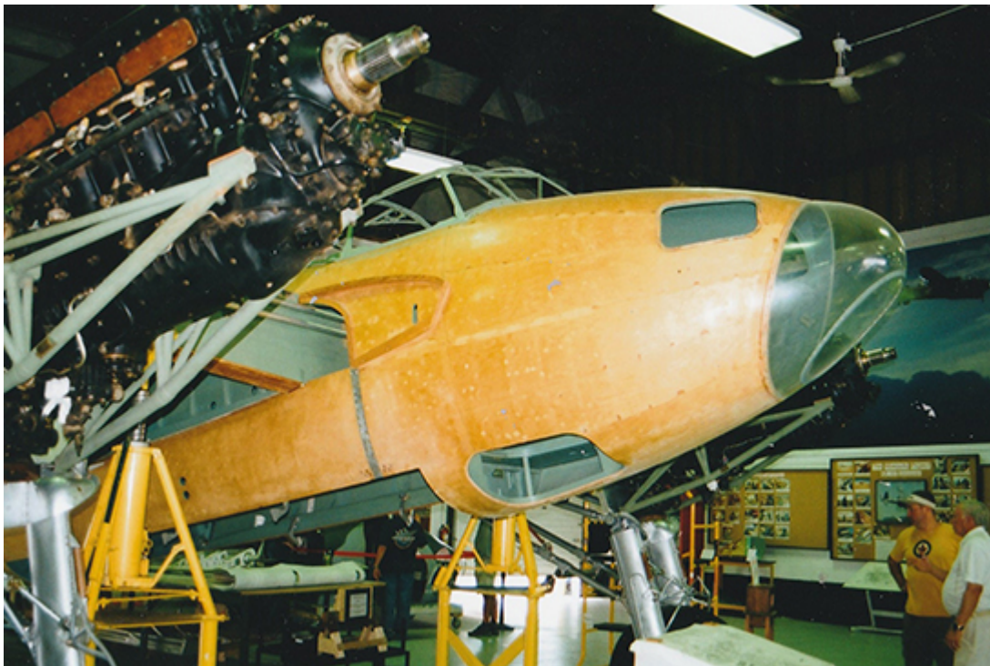
Front view of CH2A Mosquito at Windsor, July 20, 2018.