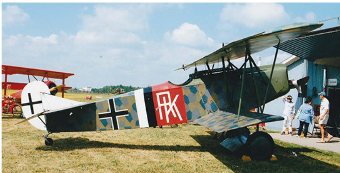
Fokker D.VII, full-scale replica, C-GWWI, rolled out at GWFM, Brampton, Ontario, July 15, 2018.