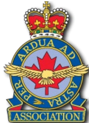
No 427 Wing RCAFA