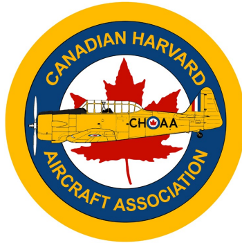
Canadian Harvard Aircraft Association